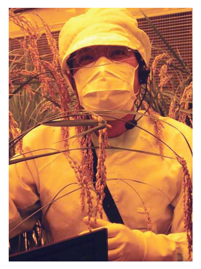
Figure 6. "Econaut" crew member of the Closed Ecological Experiment Facility (CEEF) team in Japan tending rice plants inside the facility (2007). Two Econauts and two miniature goats lived inside the facility for periods of up to 4 weeks, where ful5l life support, including a near-complete diet was provided by plants. Notice the yellowish orange light from the high-pressure sodium lamps used for crop light.

In addition to the humans, two miniature goats were enclosed in the system and were fed inedible